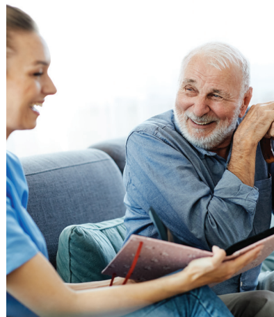
Aged Care & Boarding Facilities