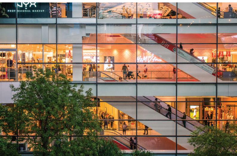
Shopping Centres & Mixed-Use Buildings

This model uses window size, orientation, shading, internal heat gains, thermal mass, solar panels, roof colour etc to construct a replica of the actual build that can offset window and insulation specifications in a dynamic manner, where cost-savings can be identified and implemented for your build.