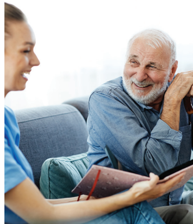
Aged Care & Boarding Facilities